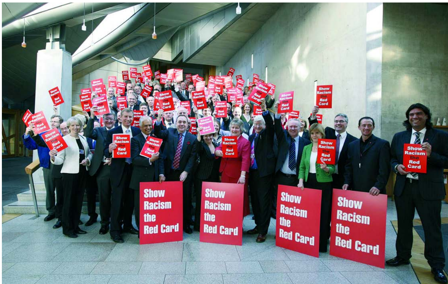
BELOW: Members of the Scottish Parliament join Show Racism the Red Card to send out a clear message